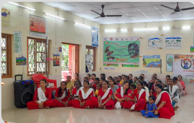
Awareness program on Beti Bachao Beti Padhao(BBBP)