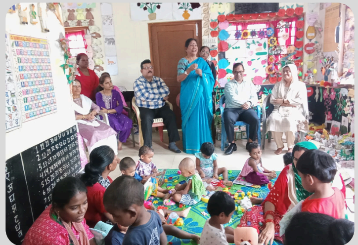
Toy Donation Drive in association with NGO "With You"