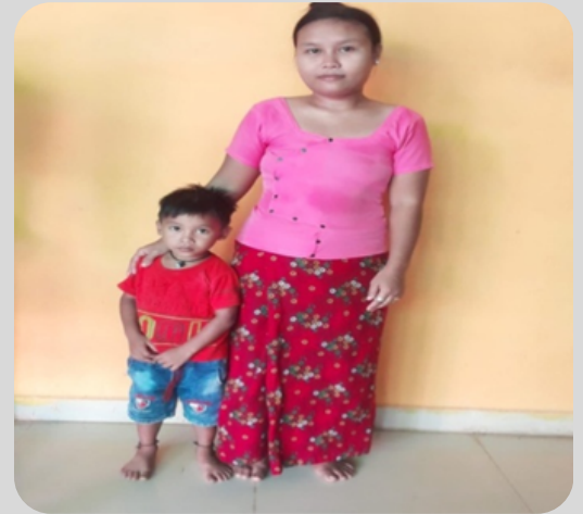
Recovered from Malnourished, Perka-II Car Nicobar