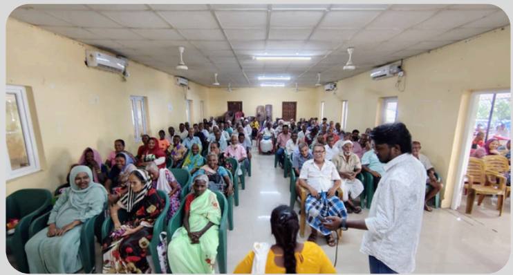
National Senior Citizen Day Celebrated at Mithakhadi Community Hall in collaboration with Elderline & Ration Rasheed Foundation