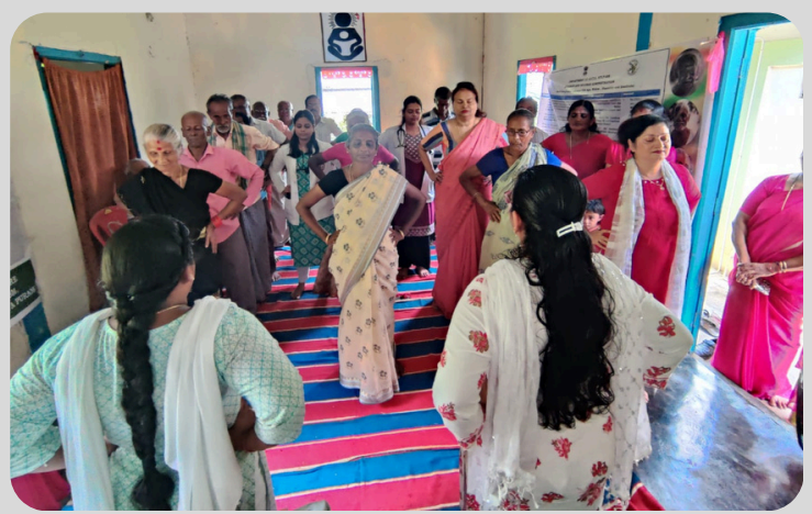
Yoga Session for Senior Citizens