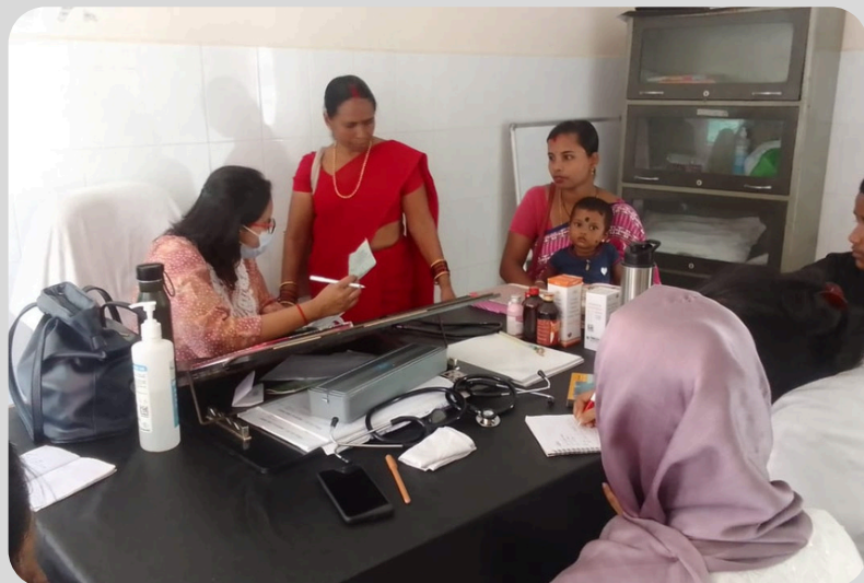
Distribution of Albendazole Tablets to children at AWCs